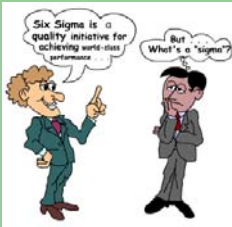
Learn Six Sigma

Gain valuable skills you can use immediately to analyze unit or company performance and apply Six Sigma principles with confidence.